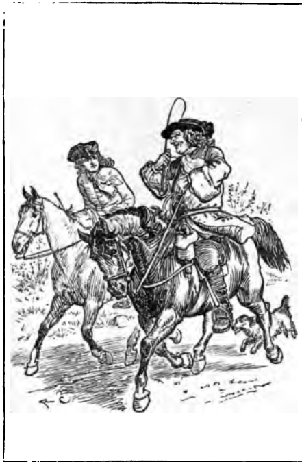
THE TORY FOXHUNTER.